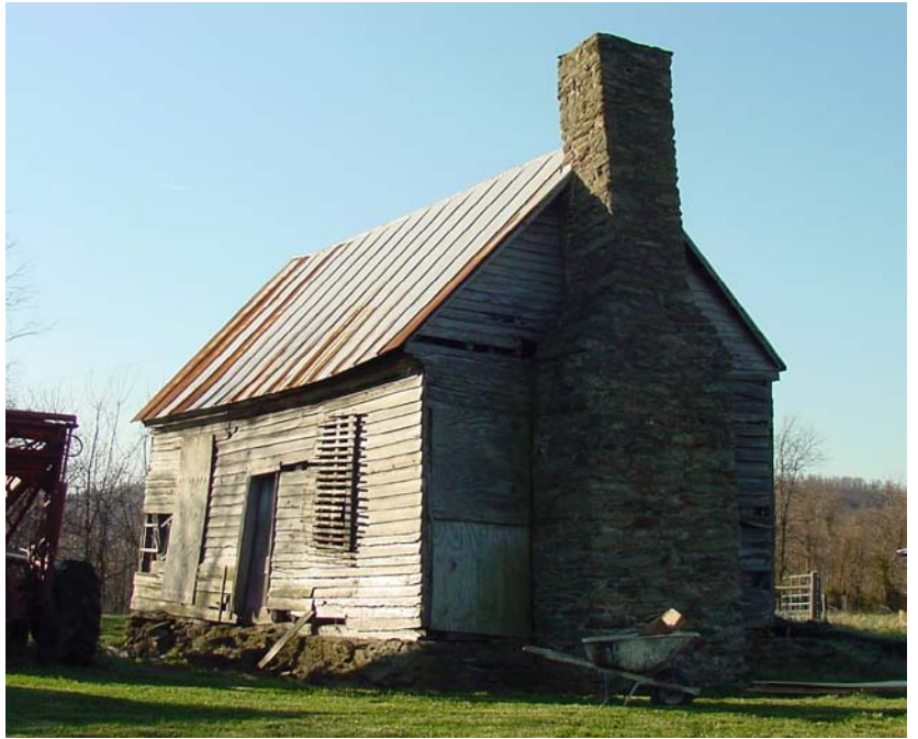
Comparing the rear elevation in March 2004 with August 2009