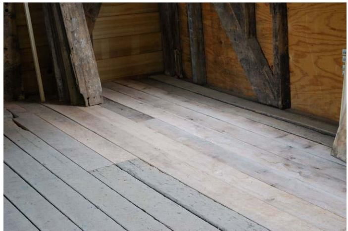
West Hall - Fence boards were inserted in place of unsafe 20 th -century boards

Still, work could continue in July to put the dwelling back together since the removal of interior paneling and the lower stairway for stabilization that began in 2004. Visible in the lighter floor boards pictured above right, master carpenters Mike and Karl patched sections of ripped replacement boards with oak fence boards in the west hall, upstairs in the garret, and reinforced the 19 th -century floor in the east parlor.