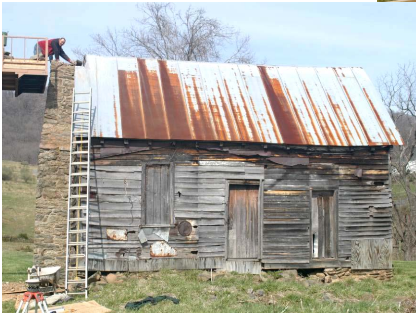
Comparing the façade in March 2004 with August 2009