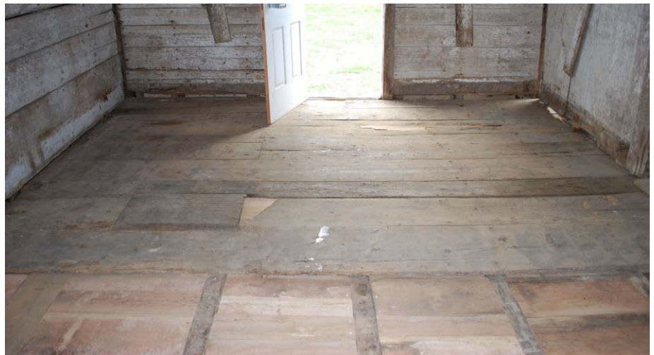
Pictured to the right, Karl and Mike carefully take up the 19 th -century floor boards in the east parlor. The lower view shows the floor after they laid boards back into position on the front floor joists that received narrow wood strips on their sides to support reinforcement boards, as shown in the foreground. This strengthening method allowed them to save the old floor boards, even those with large holes. Although now two layers exist, the floor height remains the same, and the door swings easily open. Scholars can still read the tool marks and nail evidence in the preserved 19 th -century floor in this room.