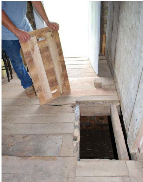
Above, Karl begins to insert his just-built cellar door that will set flush within the existing floor opening. This replaced the oversized board of plywood that haphazardly covered the entrance for many years.